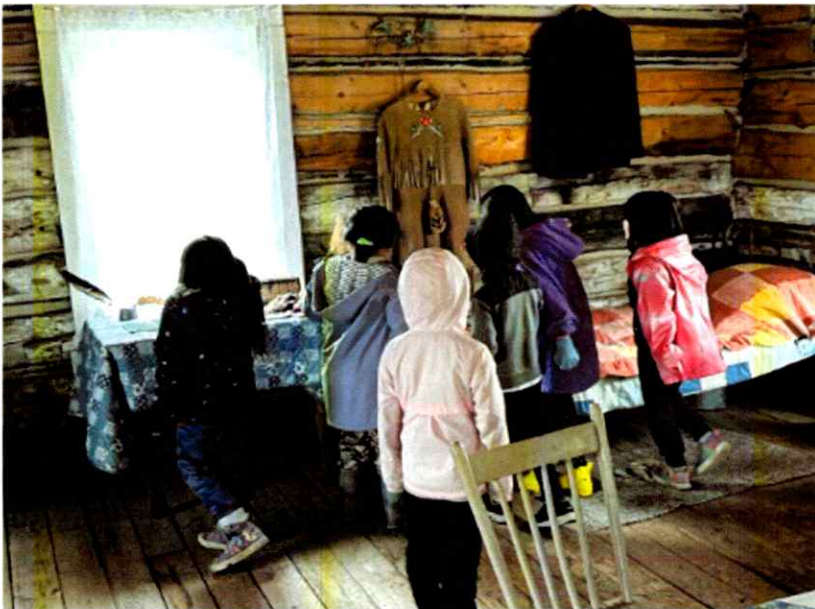
METIS CROSSING FIELD TRIP